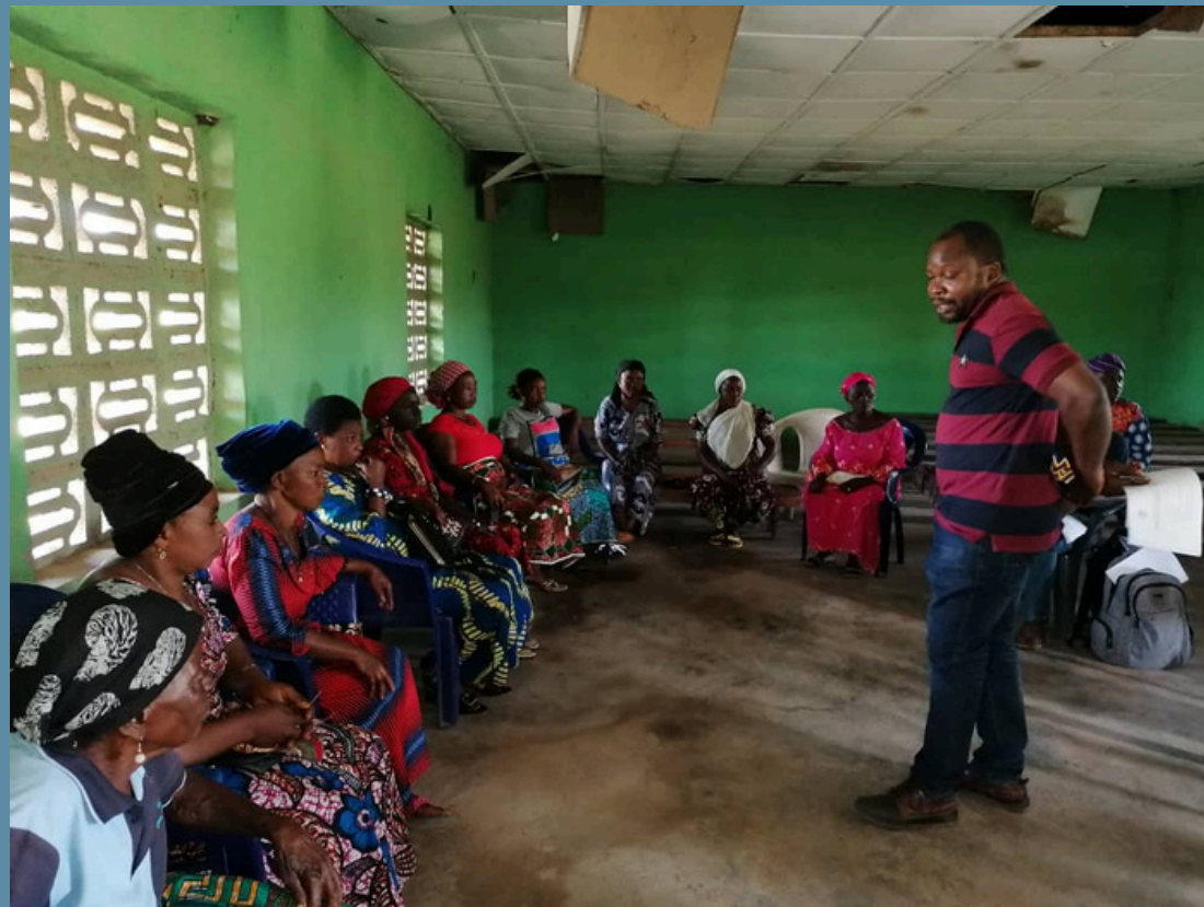
Sensitization and awareness raising on climate change and natural resource extraction in Nasarawa State