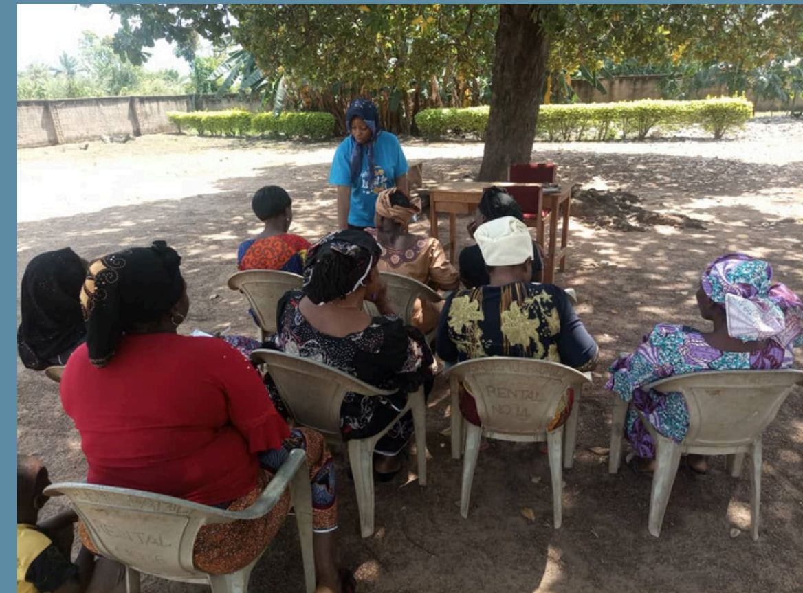
Strategy meeting with women environmental surveillance groups in Nasarawa State