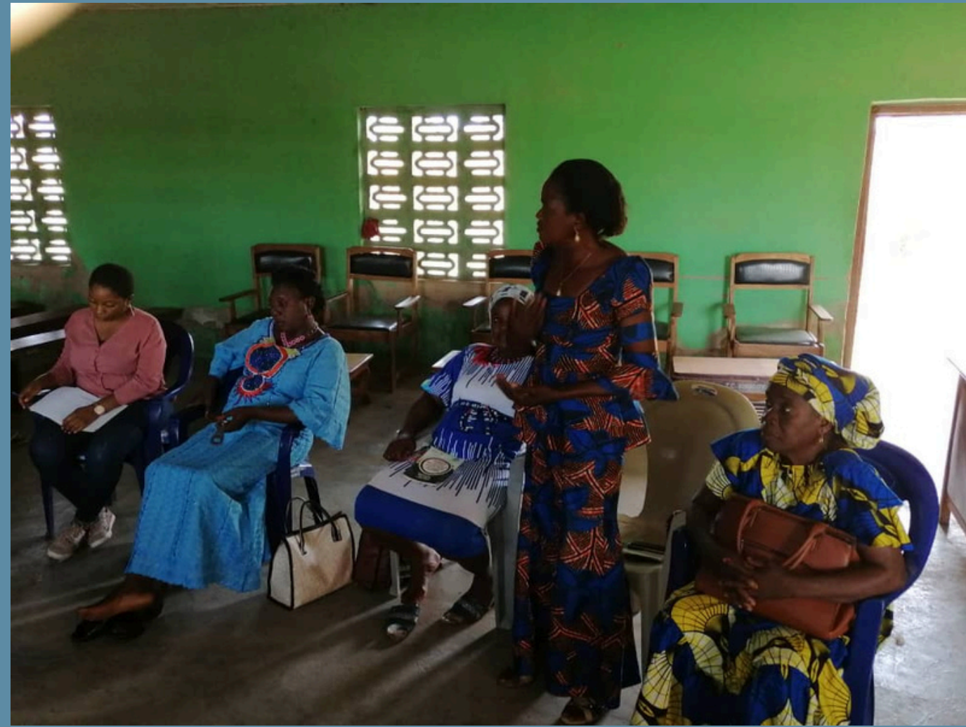
Women leader at the training of women's groups in Nasarawa State